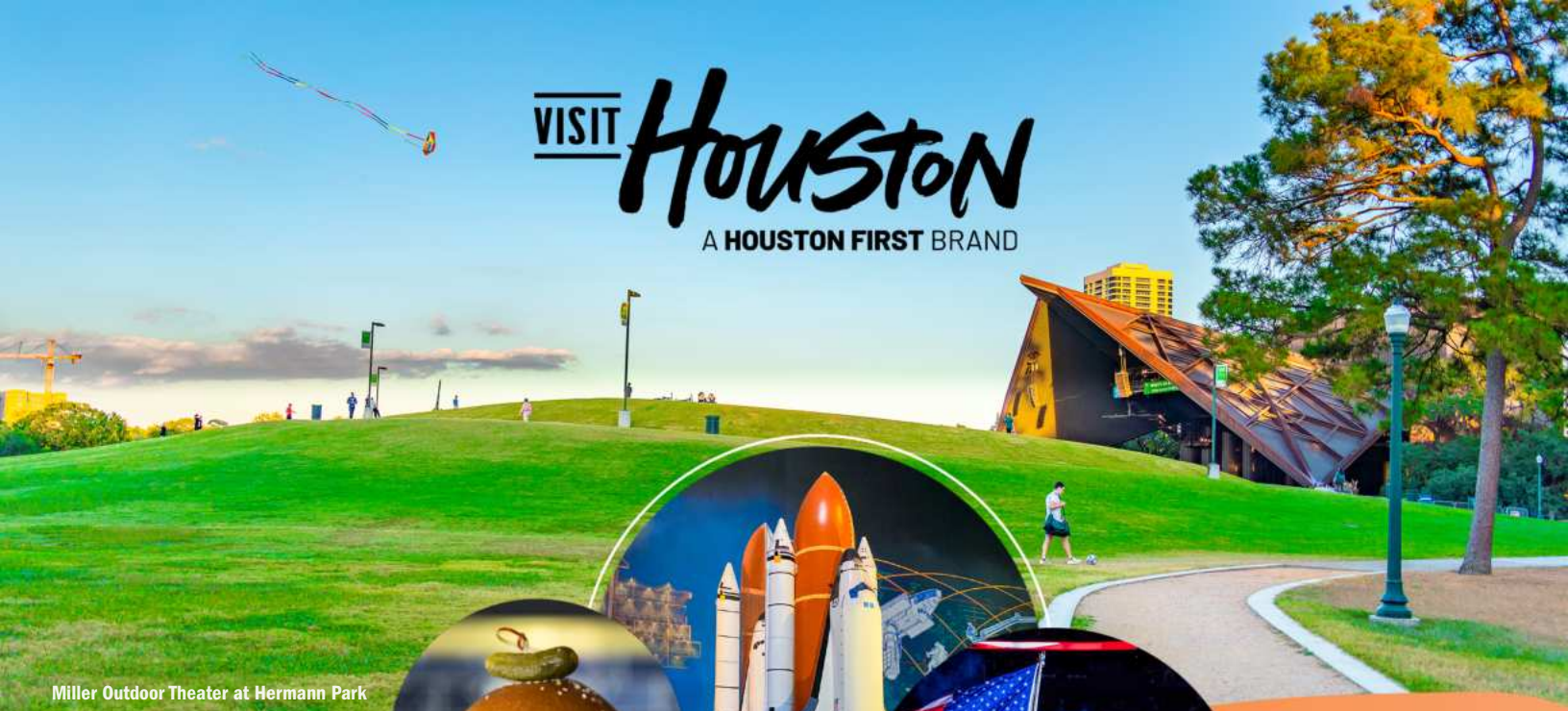
Miller Outdoor Theater at Hermann Park