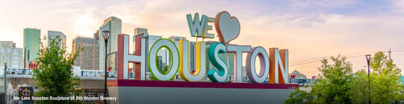
We Love Houston Sculpture at 8th Wonder Brewery